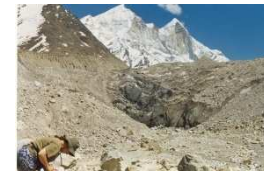
The Snout of Gangotri Glacier in Himalaya