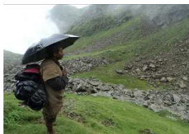
A native looks upon the remains of glacial -moraine

Recognizing various ongoing climate change phenomena and their impact, a group of people and organizations proposed a collaborative initiative, called 'Climate Himalaya Initiative', towards Sustainable Mountain Development. The initiative works towards the need of closing the existing knowledge gap in the Himalayas by developing a knowledge sharing platform, strengthening the capacities of people and organizations, generating awareness, developing leadership and conducting vulnerability mapping. It envisions a reform in the present environment governance system in Himalayan Mountains and at present works closely with volunteers and partners in building an interactive platform, scientific and practitioners' database, a vibrant leadership network and keeps a close watch on various climate change adaptation and mitigation processes in the region.